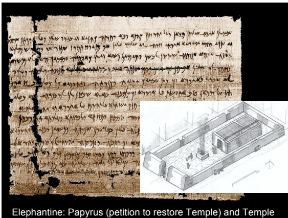
Elephantine: Papyrus (petition to restore Temple) and Temple